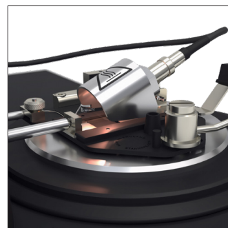
Automatic dip of ignition source and flash detection