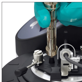
Inject 2ml sample