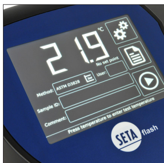
Select test temperature