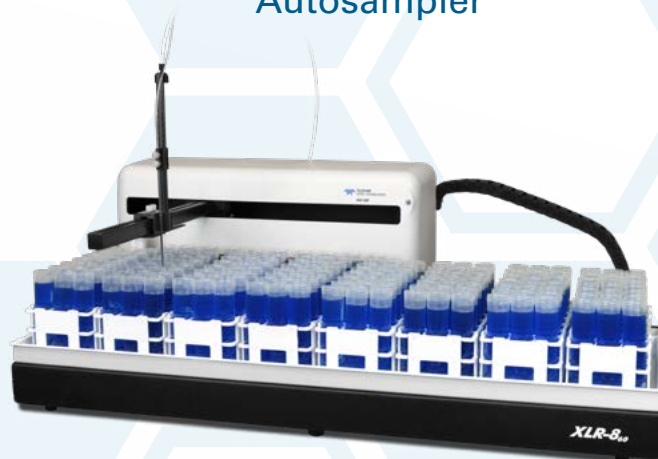
XLR-8 60 Extended Autosampler