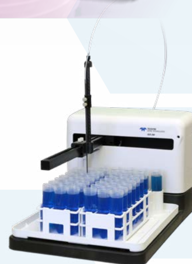
ASX-280 Compact Autosampler