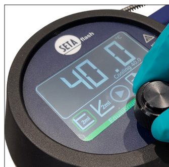
Select test temperature